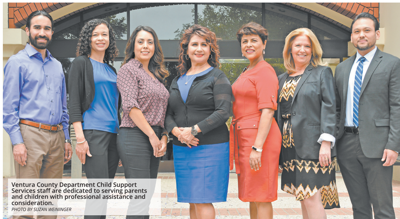
Ventura County Department Child Support Services staff are dedicated to serving parents and children with professional assistance and consideration.