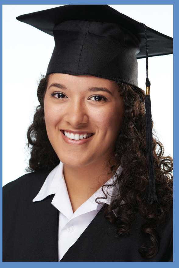
Making College Affordable